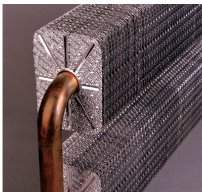
Fine Copper pipe Aluminum fins Heat exchanger