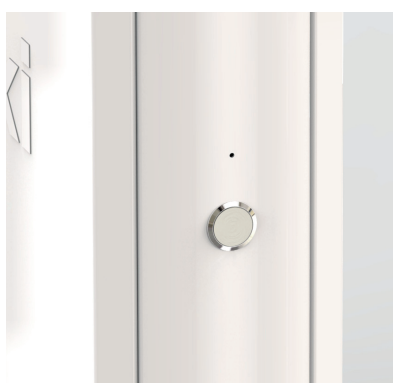
Manually and automatic fan speed control with just "1" press at the button for quick heating.