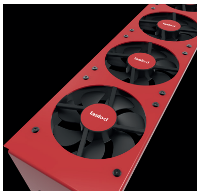
With Ultra-low noise and low power-consumption 24V fans, more safety and more powerful